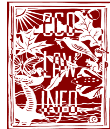
Logo for the Resource Library for the Environment and the Law.

The Resource Library for the Environment and the Law is housed in the CELA offices and is open to the public by appointment.